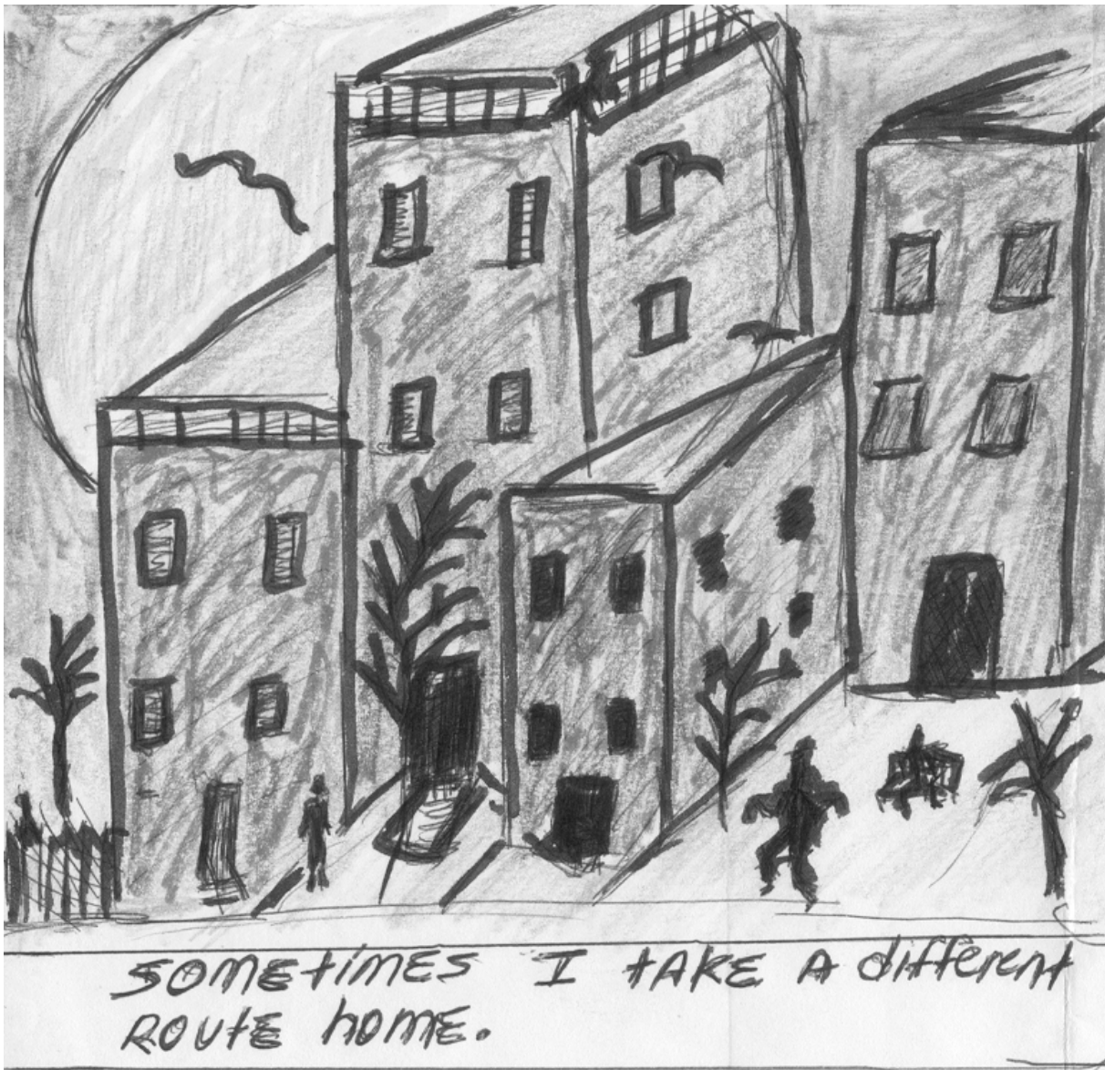
"Different Route" by Anonymous