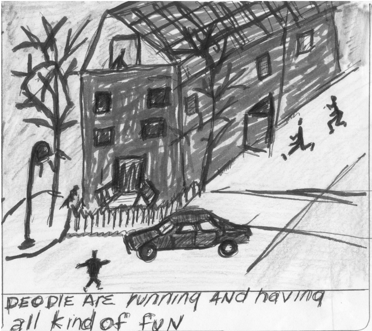
"Fun" by Anonymous